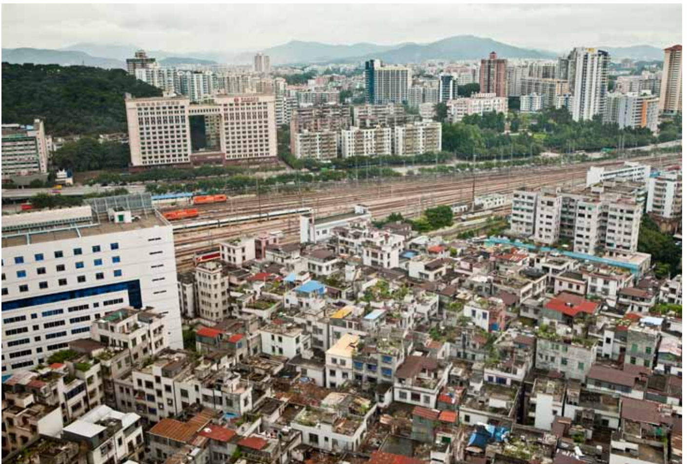
Above: Dubai, United Arab Emirates Below: Guangzhou, China