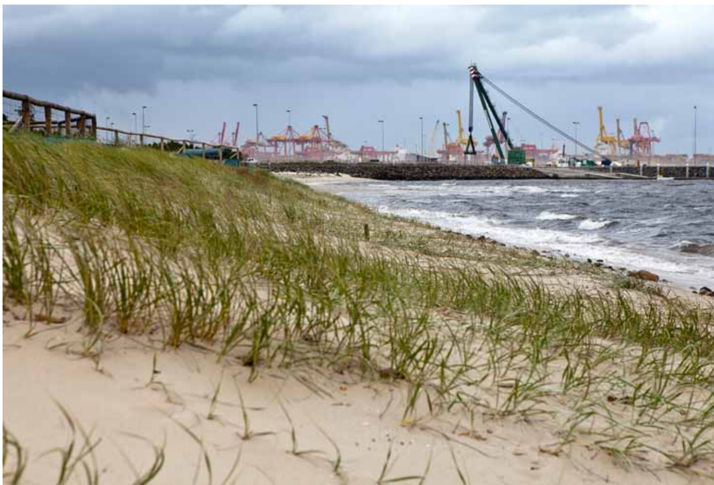
Above: Dubai, United Arab Emirates Below: Port Botany, New South Wales