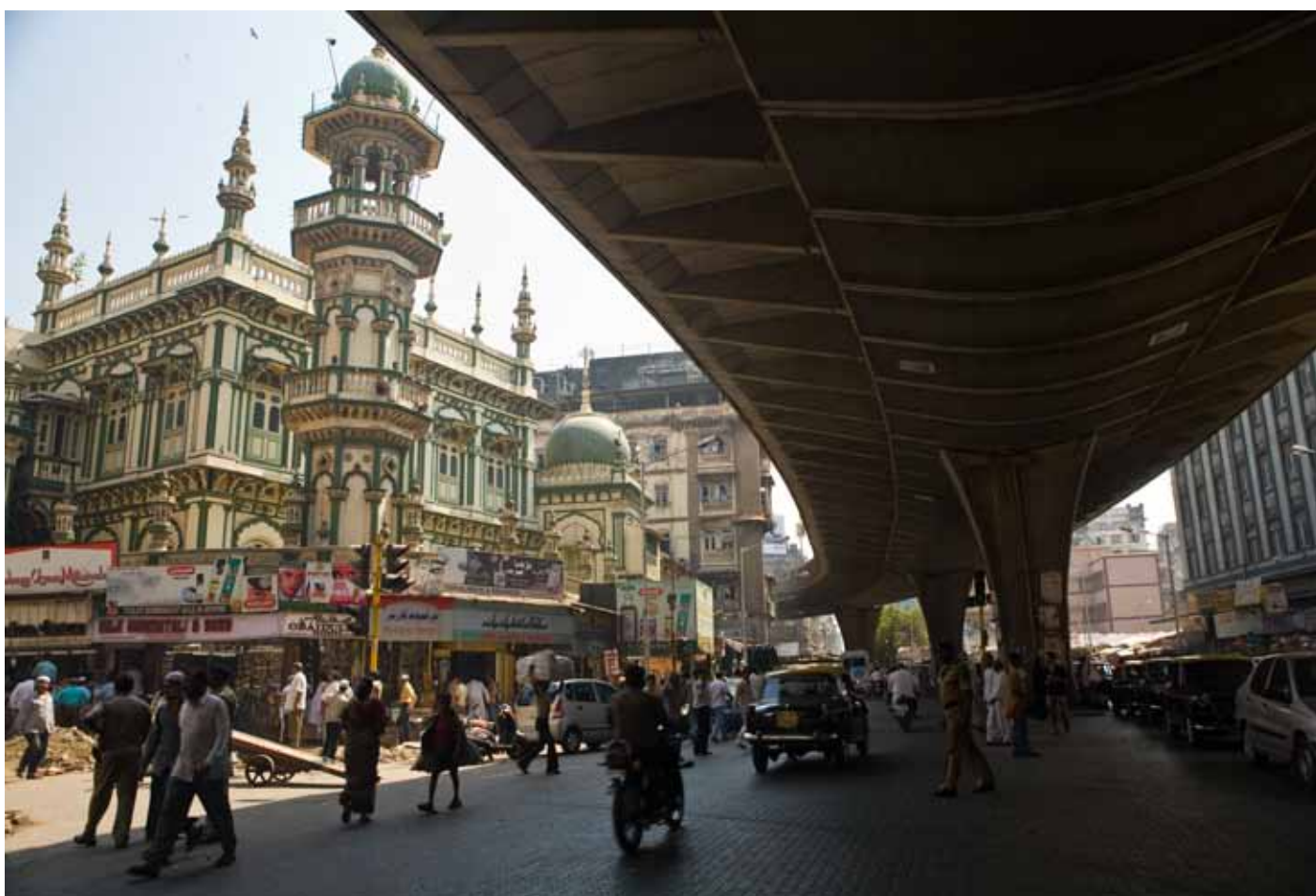
Above: Manchester, United Kingdom Below: Mumbai, India